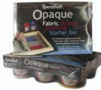
44590 Opaque fabric screen ink starter set 6 x 119ml tubs

A range of 10 iridescent colours, ideal for use on dark fabrics, paper and cardboard (not for use on nylon). Wash fast when properly heat-set, easy to clean with water.