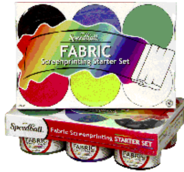
44504 Fabric screen ink set 6 x 119ml tubs

A range of brilliant colours for use on Cotton, Polyester blends, Linen rayon and other synthetic fibres (not for use on nylon). Wash fast once properly heat set, easy to clean with water.